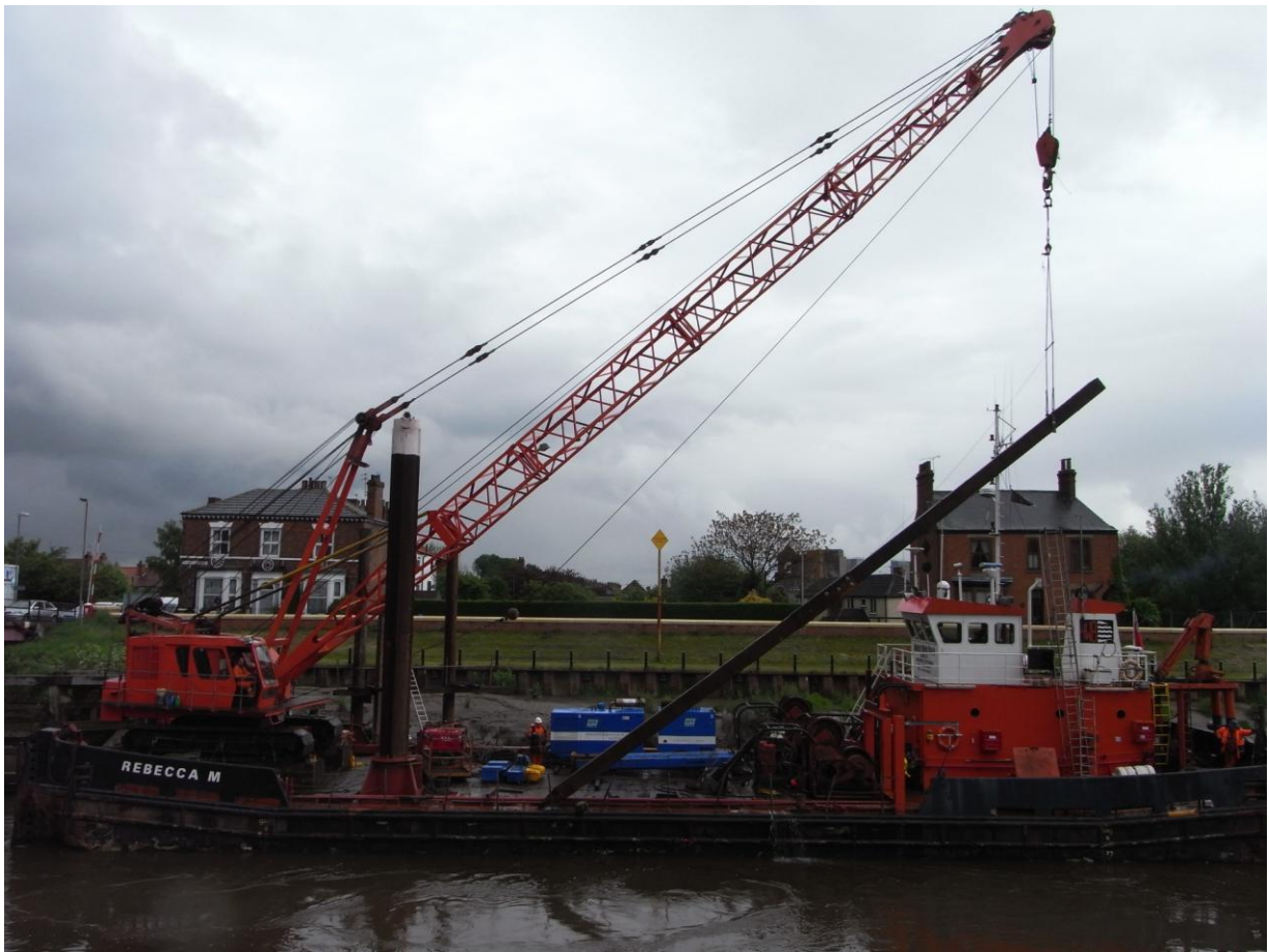
Replacing fenders at swing bridge, 2009.