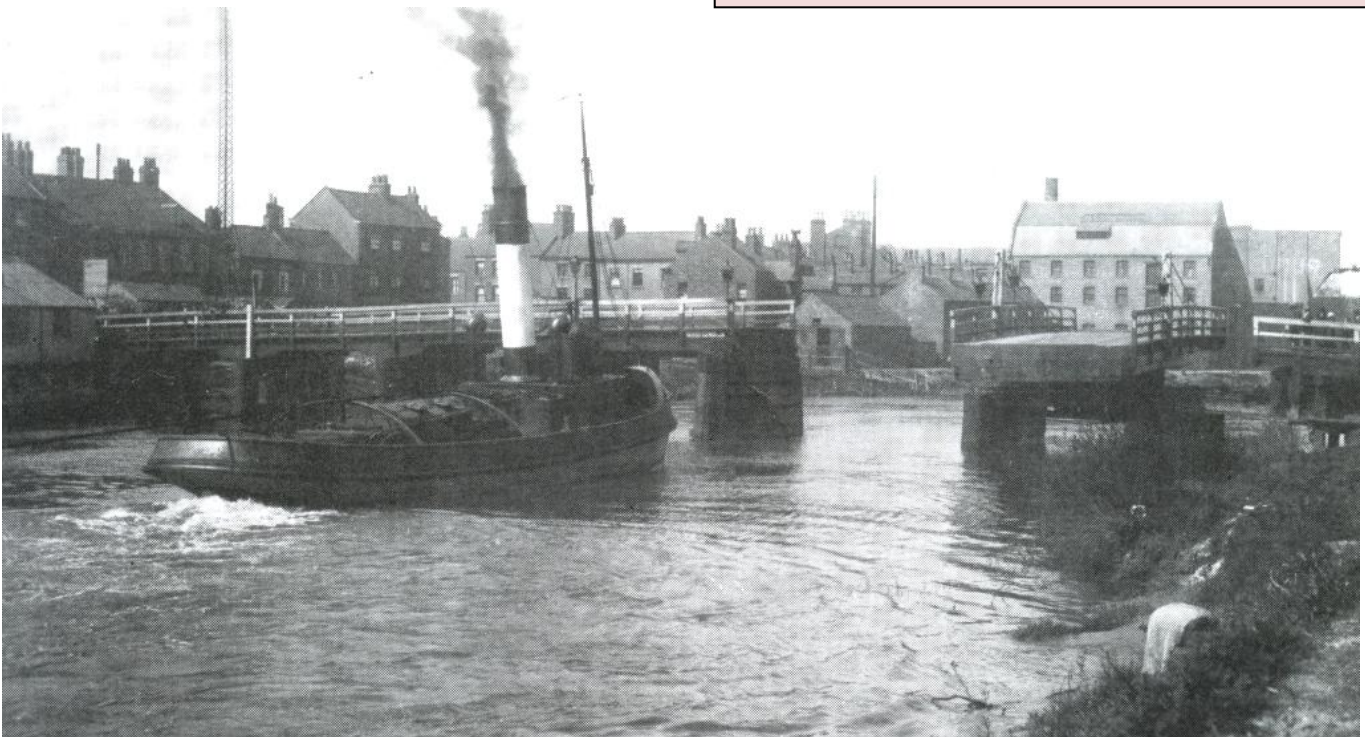
Tug 'Robie' approaches Selby Toll Bridge, 1930s

The demand that the central span of 31' (10 m) had to open in under a minute is a very reasonable one, given the tidal conditions that can exist around Selby. The effect of an incoming tide of up to 9 knots, allied to the narrowing of the channel by the bridge's supports mean that negotiation of the swing bridge is an expert task. Until 1970, this opening was carried out by muscle power and mighty cog wheels, two of which can be seen on the bridge house on the Barlby bank..