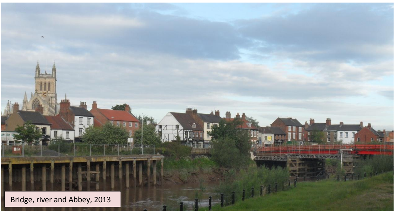
Bridge, river and Abbey, 2013

As the volume of trade increased, this restriction was clearly unacceptable, and a proposal for a bridge at Selby was put forward in the late 1780s. This proposal was hotly contested by local landowners, some river men and traders in York who felt their livelihoods would be taken away. After an extensive survey of traffic, it was determined a bridge would be "of great and daily benefit" to the people of Selby.